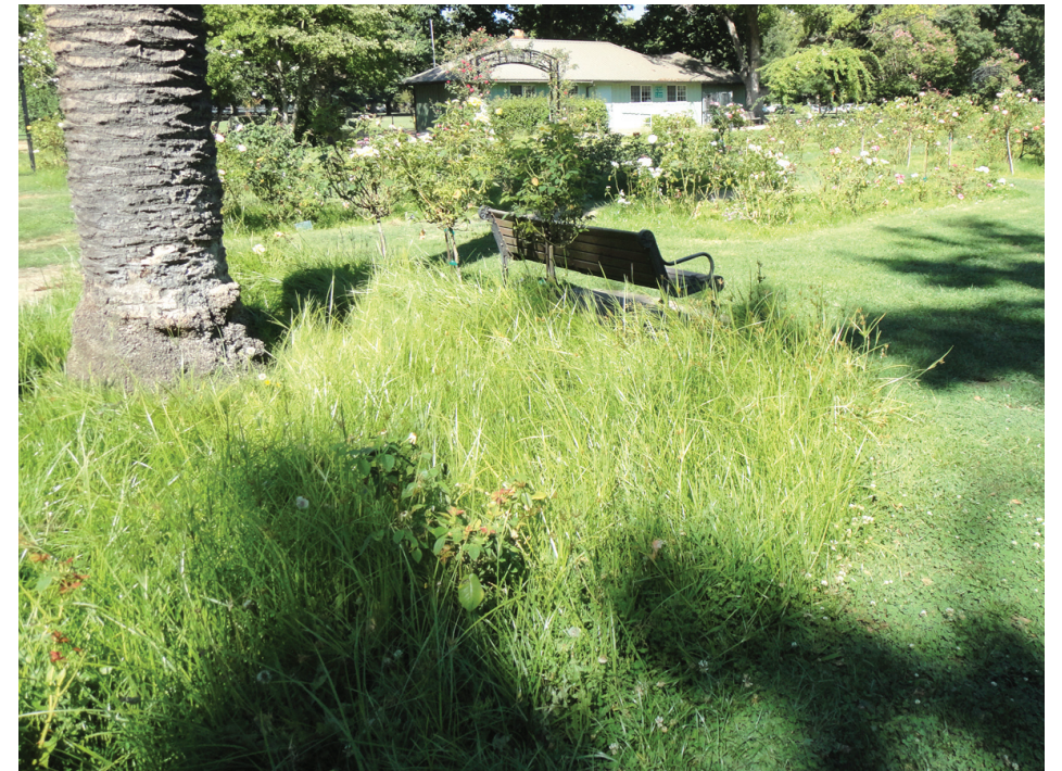
Conditions at the McKinley Park Rose Garden on August 16, 2011