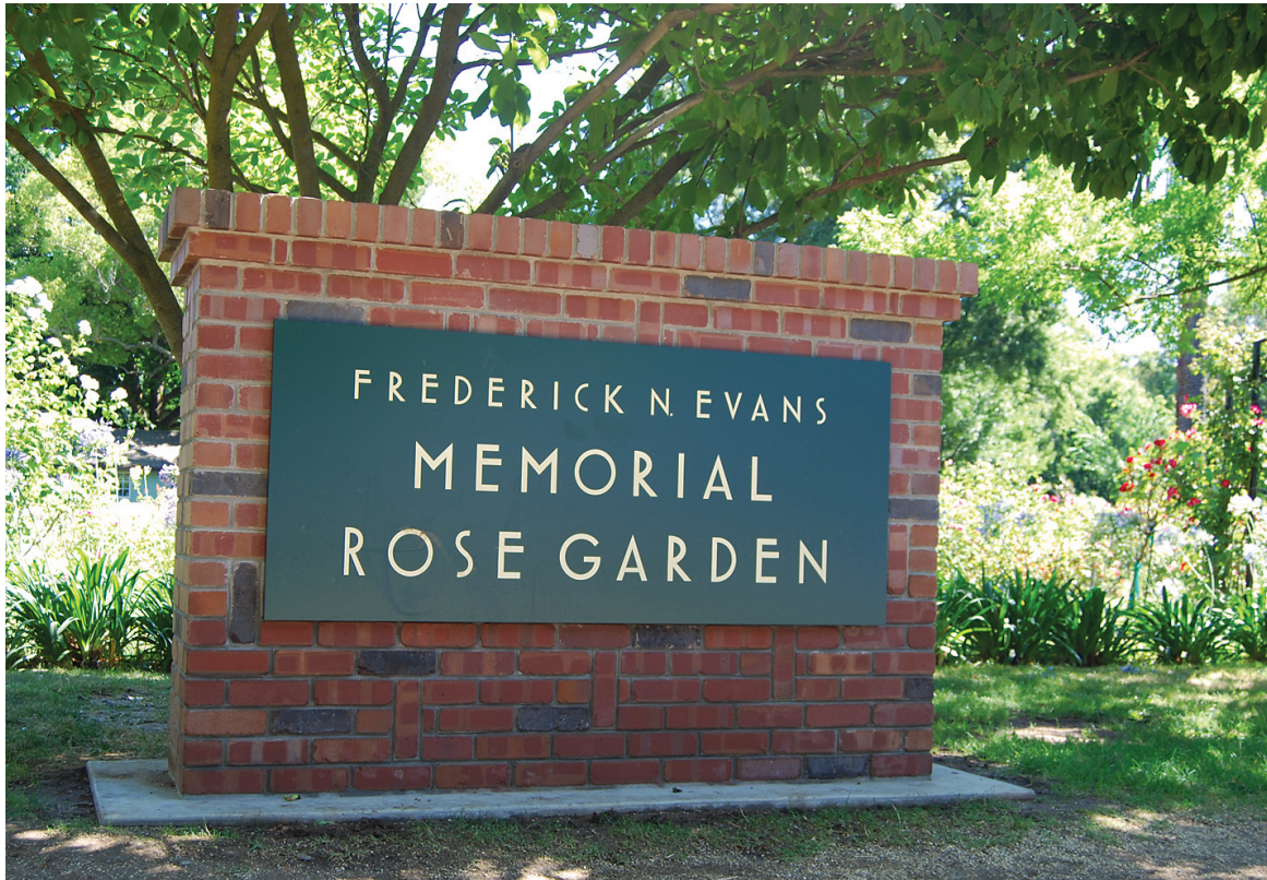
New sign donated by the Friends of East Sacramento in June 2011