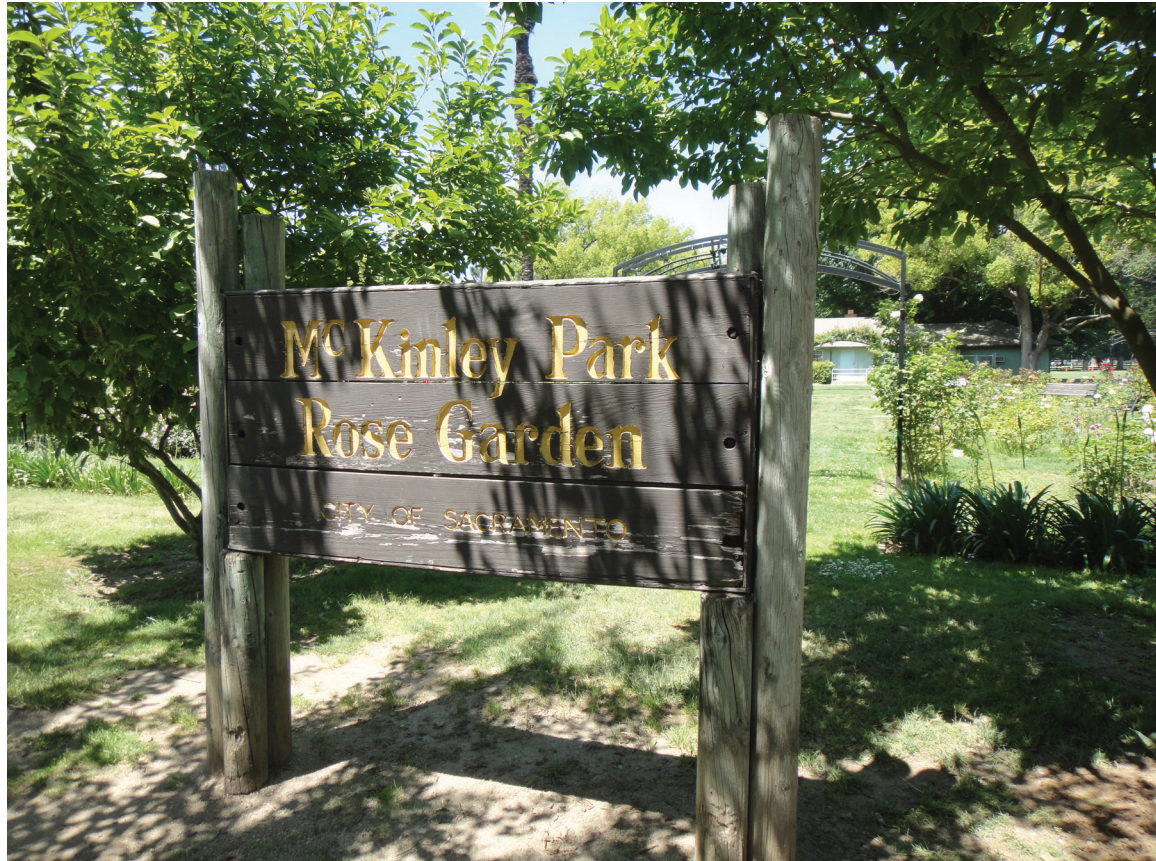
The "before" sign